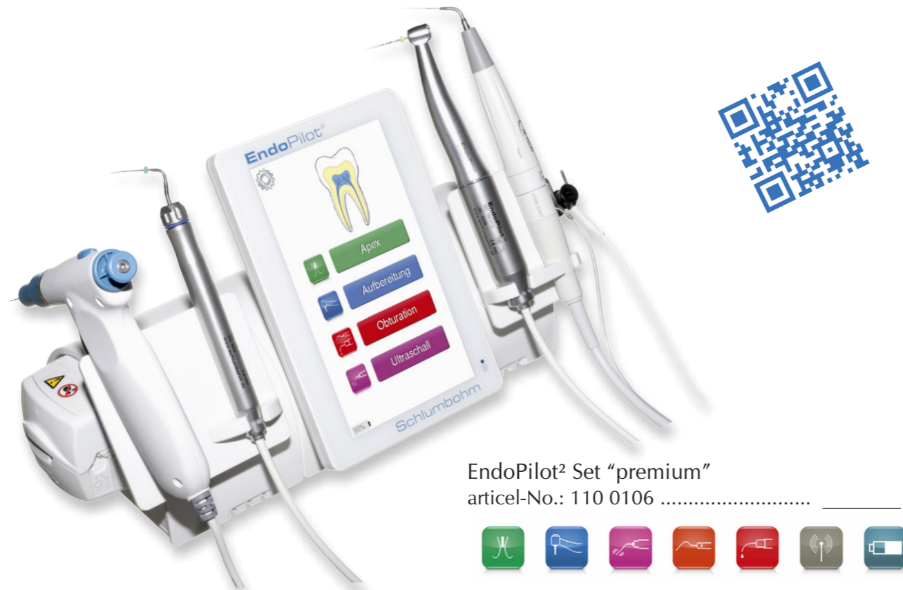
EndoPilot 2 Set "premium" artitel-No.: 110 0106 .....